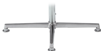
AL4 (Ø 730) (Non usare su versioni oscillante - Don't use it on tilt versions) Base 4 razze in alluminio pressofuso lucido solo con piedini 4-stars polished die-cast aluminium base only with feet Piétement 4-branches en fonte d'aluminium polie avec patins 4-Fusskreuz aus Pressguss-Aluminium, glänzend mit Gleitern 4-radios base en aluminio pulido con deslizadoros