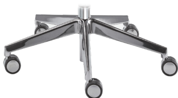
AL5 (Ø 654) Base in alluminio pressofuso lucido (c/ruote e gas cromati) Polished die-cast aluminium base (w/chromed castors and gaslift) Piétement en fonte d'aluminium polie (avec roulettes et gaz chromés) Fusskreuz aus Pressguss-Aluminium, glänzend (mit verchromten rollen + Gasfeder) Base en aluminio pulido (con ruedas y gas cromados)