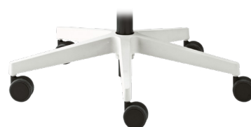
APW (Ø 675) Base in nylon bianco White nylon base Piétement en nylon blanc Fusskreuz aus weissem Nylon Base en nylon blanco