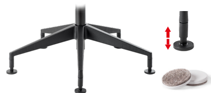
APP (Ø 680) Base in nylon nero con piedini dinamici e reversibili nylon/feltro Black nylon base with dynamic DUO glides nylon/wool felt Piétement en nylon noir avec patins dynamiques et réversibles nylon/feutre Fusskreuz aus Nylon schwarz mit dynamischem DUO-Gleiter Nylon/Filz Base en nylon negro con deslizadoros dinámicos y reversibles nylon/fieltro