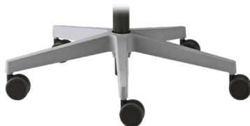
APG (Ø 675) Base in nylon grigio Grey nylon base Piétement en nylon gris Fusskreuz aus grauem Nylon Base en nylon gris