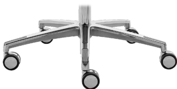
AL3 (Ø 654) Base in alluminio pressofuso lucido (c/ruote e gas cromati) Polished die-cast aluminium base (w/chromed castors and gaslift) Piétement en fonte d'aluminium polie (avec roulettes et gaz chromés) Fusskreuz aus Pressguss-Aluminium, glänzend (mit verchromten rollen+Gasfeder) Base en aluminio pulido (con ruedas y gas cromados)