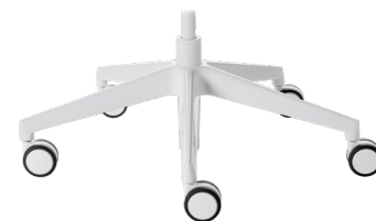
AWW (Ø 654) Base in alluminio pressofuso verniciato bianco. Die cast aluminum base, white painted. Piétement en fonte d'aluminium verni blanc. Fusskreuz aus Pressguss-Aluminium, weiss lackiert. Base en aluminio pintado blanco.