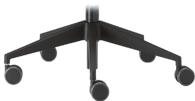
APS (Ø 660) Base in nylon nero Black nylon base Piétement en nylon noir Fusskreuz aus schwarzem Nylon Base en nylon negro